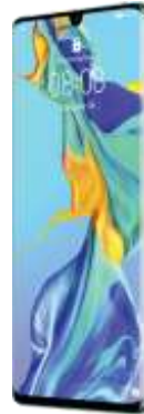
HUAWEI P30 Pro

HELLO CHANGE HELLO CHANGE HELLO CHANGE HELLO CHANGE HELLO CHANGE HELLO CHANGE