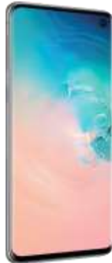
Samsung Galaxy S10

Exclusive to Corporate Individual Scheme